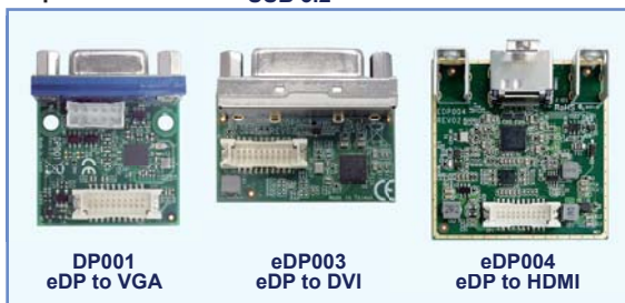
DP001 eDP to VGA eDP003 eDP to DVI eDP004 eDP to HDMI